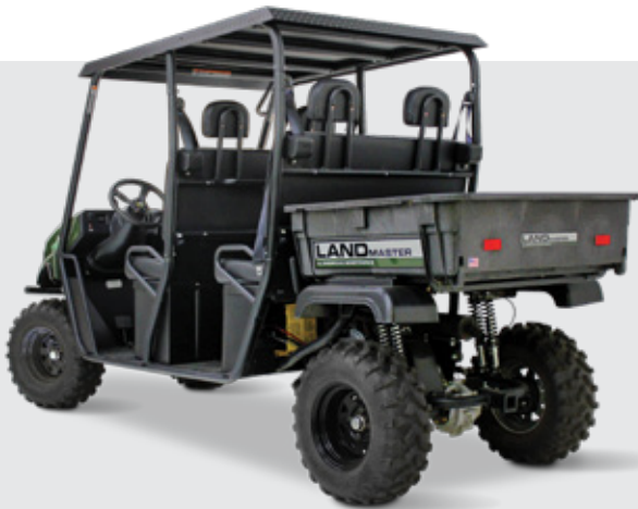
unit shown with optional diamond plate aluminum

Total range of up to 130 miles (see mileage estimate chart)