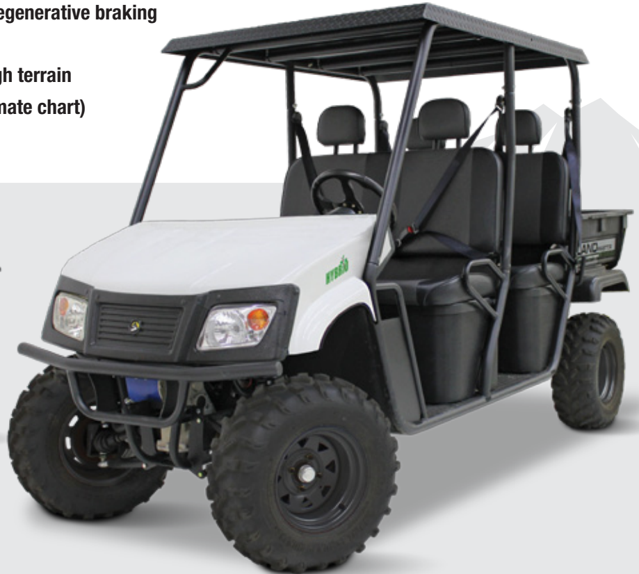
unit shown with optional diamond plate aluminum hard top and non-standard white hood